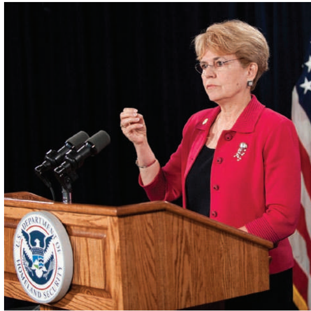
Jane Lubchenco urged caution in discussions about deep-sea oil.

Although NOAA never completely denied the possibility that the oil might spread far below the surface, it consistently backed away from confirming the Pelican findings, and pointed to a need for definitive confirmation. Weeks after the cruise, Jane Lubchenco, head of NOAA, still seemed uncertain about the evidence for a significant plume of oil at depth. “Obviously it would be highly unusual if we didn't find oil right close to the well; the question is what's happening farther afield,” she said. “I think the bottom line is that there is a lot of potential out there for jumping to conclusions that may not be warranted and that we are all served best by proceeding in a careful, thoughtful and quantifiable manner.”